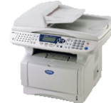
5 IN 1 MFC