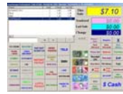
POS + SHOP A/C